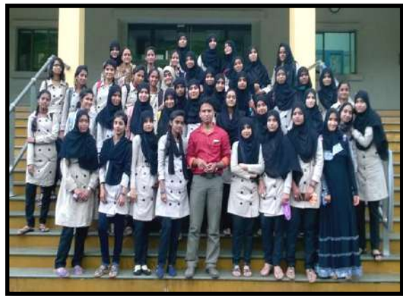
Field Visit Lavasa, Pune