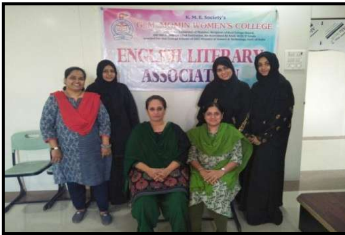
Student seminar on Research Methodology