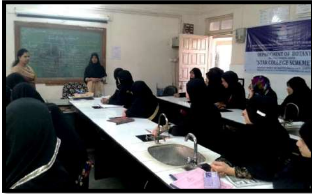
Work Shop on Research Methodology