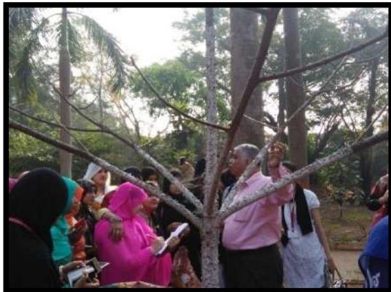
Field Visit to Saguna Bagh