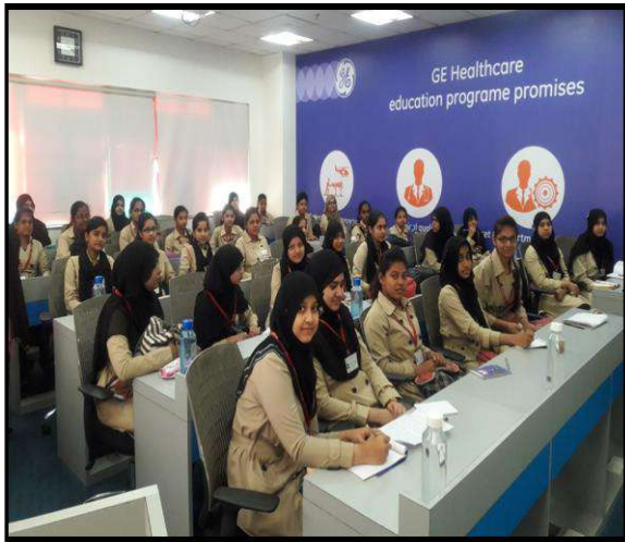
Industrial Visit at GE HealthCare, Thane