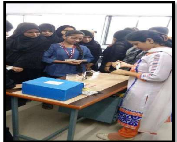
Workshop on Foldscope