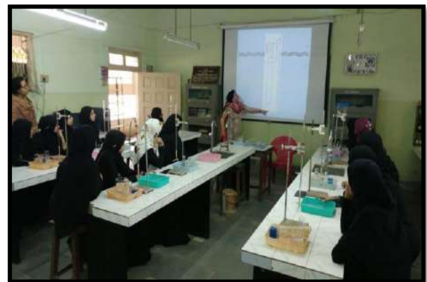
Hands on Training on Calibration of apparatus