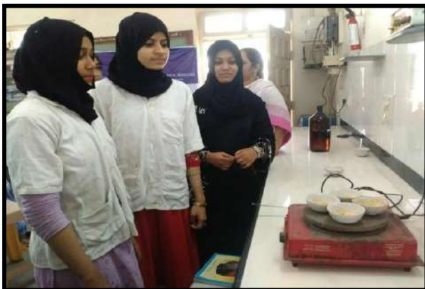
Hands on Training in Analytical Chemistry