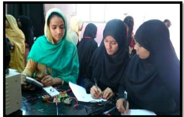
Hands on Training in Basic Electronics