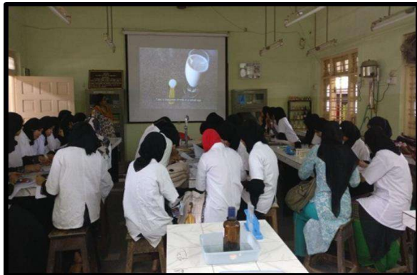
Hands on Training on Milk Adulteration