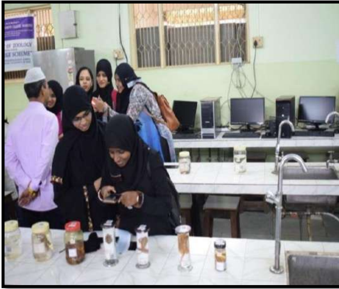
QR Coding Workshop organized by Department of Zoology