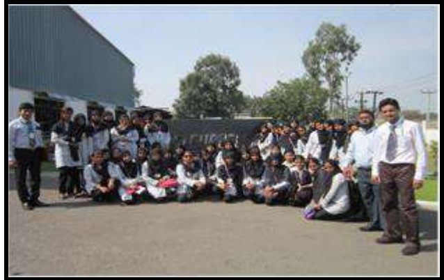
Industrial Visit to EURO FLEX,