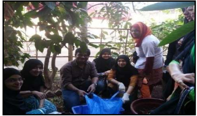
Hands on training to the students for the preparation of Vermi composting on 15 th December 2016