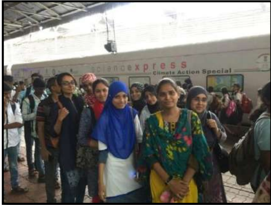
Study Tour Visit to Science Express