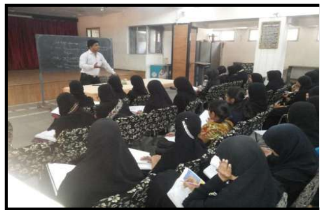
Guest lecture on MHRM and Export