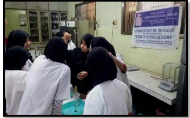
Food Testing and Lipid Estimation