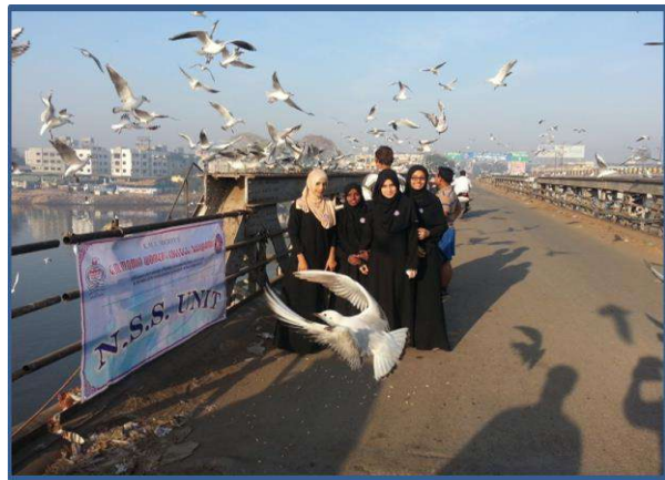
Study Tour for 'Migratory Bird Watching'