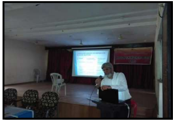
Guest lecture program on Indian Companies Act