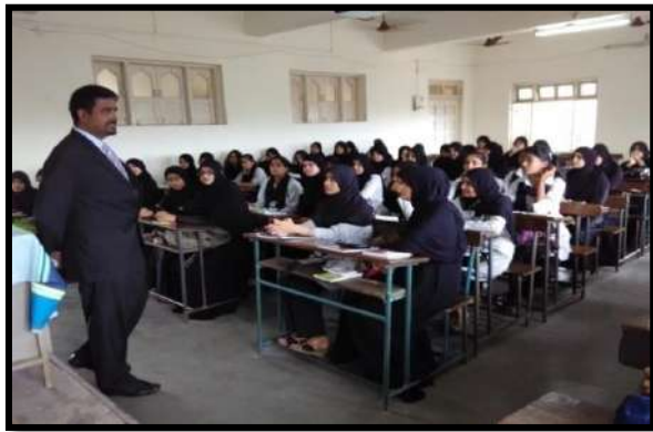
Guest lecture program on International Finance