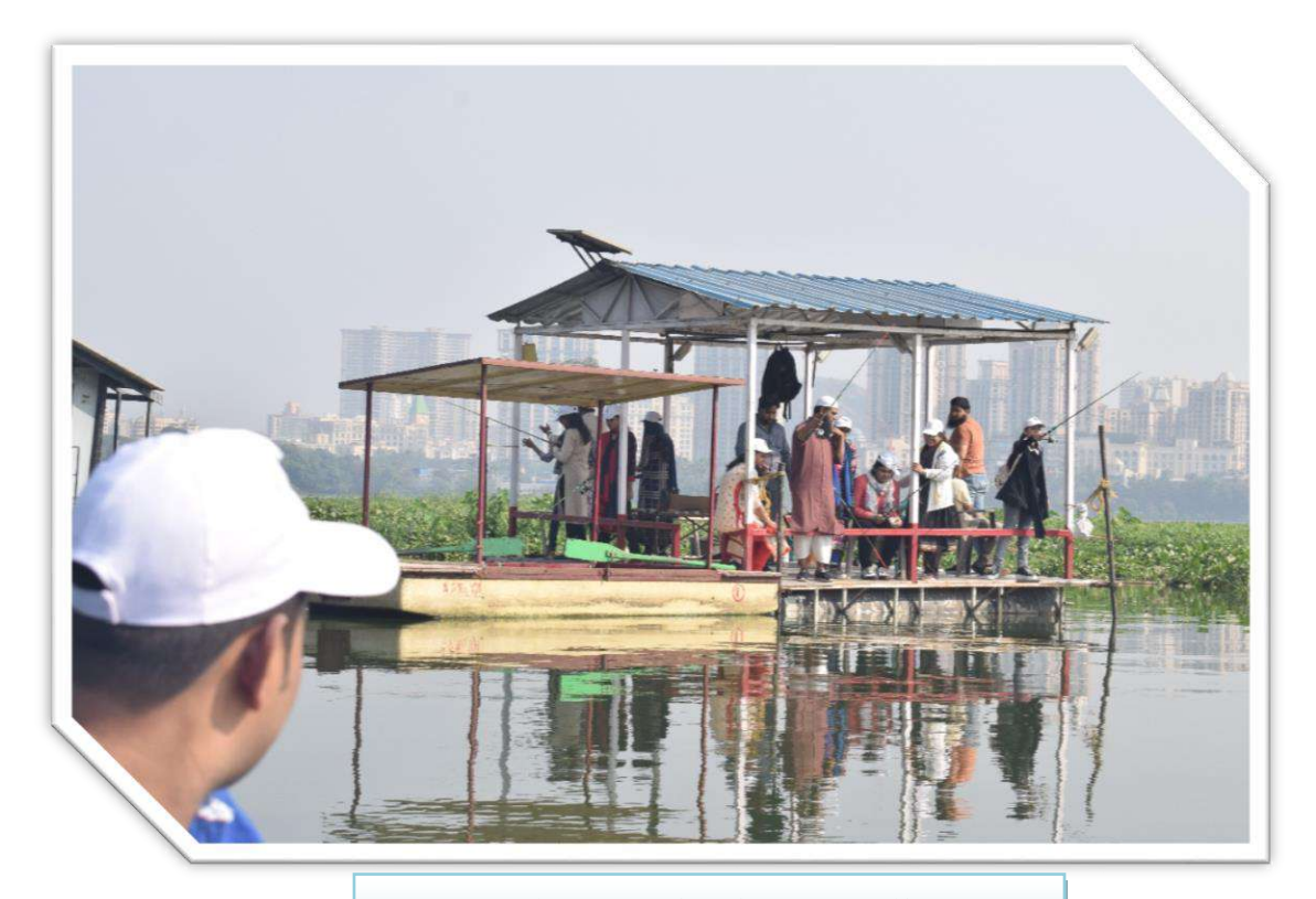
Students enjoying Angling